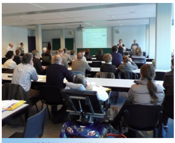
AEGIS National Workshop in Leuven

(working language was Dutch) aiming at presenting the project, as well as gathering feedback from Belgian end-users and other stakeholders on some core use cases. The workshop was organised at the KUL campus in Heverlee. In total, 53 persons took part in the workshop, among them 35 end-users with disabilities (people with vision, hearing, mobility and cognitive impairments) and representatives of Belgian umbrella organisations (FEVLADO, Licht en Liefde, Werkgroep Vorming en Aktie vzw).