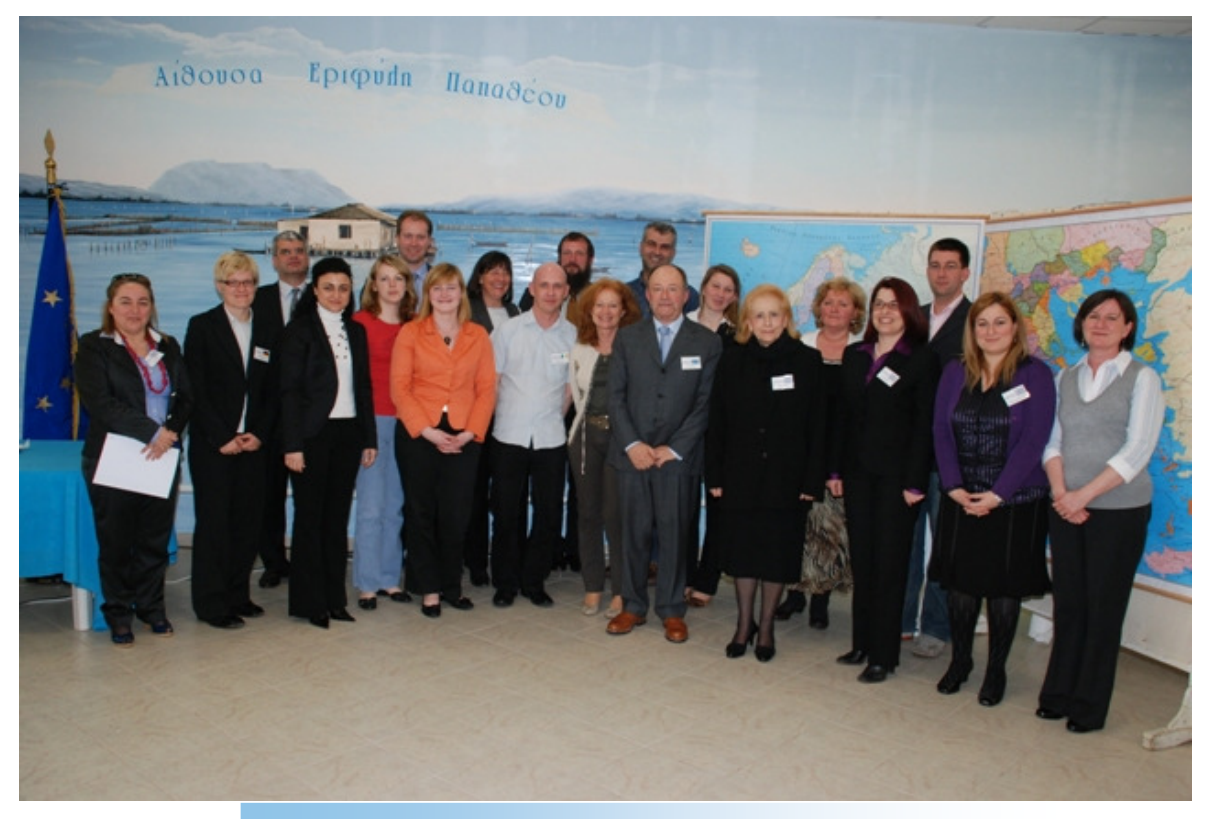
Project-Workshop at the Partner "Pagania Eleousa" in Messolonghi in Greece

More information can be obtained with the project newsletter. This can be requested on the website <a href="https://www.best-quality.eu">www.best-quality.eu</a>