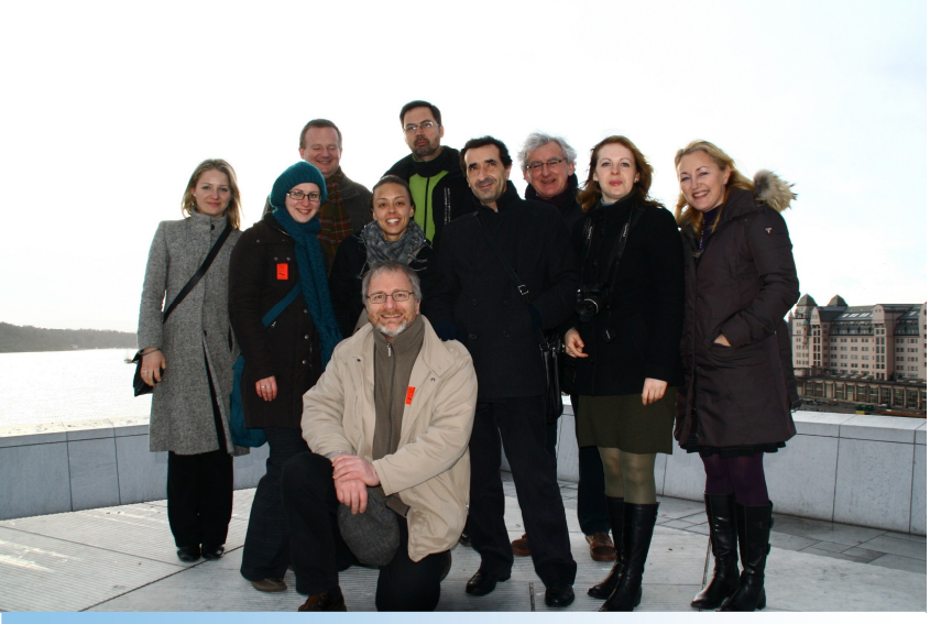
EQUASS in Practice project partners on the roof of Oslo Opera

The start-up seminar for the "EQUASS in Practice" project took place on 12-13 January 2009 in Oslo. The meeting gathered all project partners from Europe as well as representatives of the local Leonardo da Vinci agency SIU (Norwegian Centre for International Cooperation in Higher Education). The discussions around the table focused on the first thoughts about a national implementation strategy of EQUASS Assurance for each country and identification of potential EQUASS Local Licence Holders. EPR was designated to evaluate the 'EQUASS in Practice'-project and to register all dissemination activities throughout the project period.