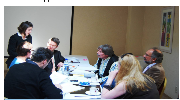
Participants working in groups