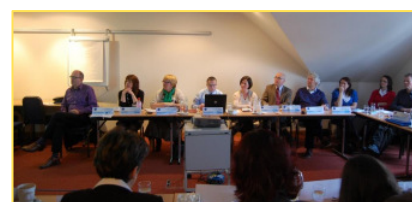
Meetings, visit at the Cedar's Ballymena Resource Centre and scenic walks by the coast kept the training participants busy.