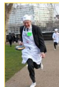
Lord Dubs competes in this year's race

View images of the Rehab Parliamentary Pancake Race on Flickr: http://www.flickr.com/photos/momentumuk