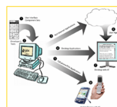
The ÆGIS system: towards accessible ICTs