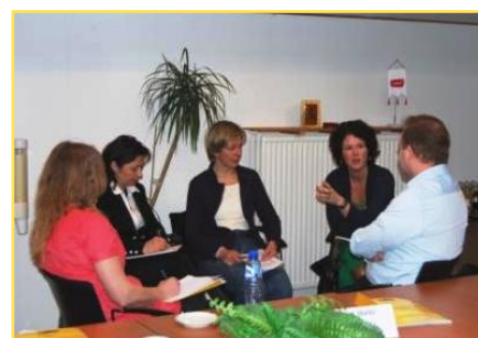
Person-centred planning is a must-have skill for rehabilitation professionals.

service user increasing their independence. The group also reflected on how to implement person-centredness in complex interdisciplinary services as well as with partners.