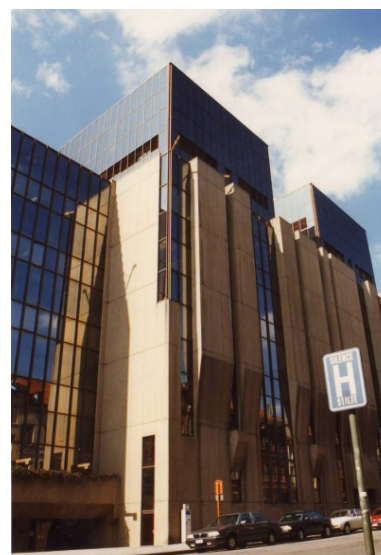
The High Level Group on Disability advises the Commission on the EU-wide situation with regard to disability.

In fact, after the previous consultation of EPR by the European Commission done through an interview at the end of the 2009, EPR was also invited to participate on 5 March at a discussion forum on the new Strategy. This forum gathered representatives of all the major European sectoral stakeholders.