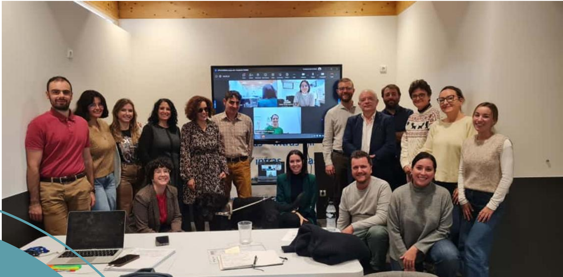
INTEREHA WG, November 2025, Valladolid, Spain