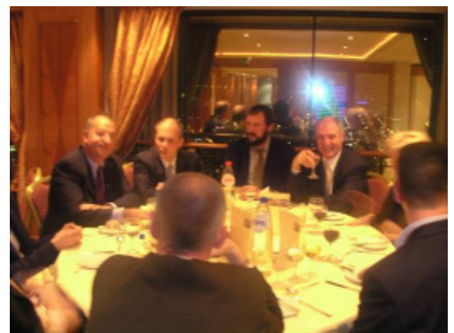
An evaluation form was distributed to delegates at the Conference. Unsurprisingly, the winner was the Gala dinner at the spectacular Sheraton Hotel.