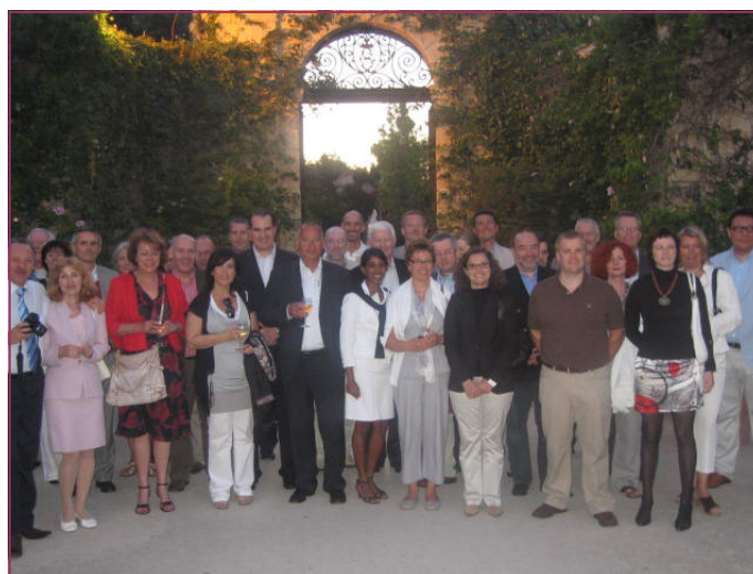
The Directors enjoyed the beautiful venue in Malta

tion of our sector to European and national stakeholders. Once again, the annual Workshop for Directors proved to be a very positive and successful event, fostering interactive discussions, fruitful conclusions, excellent networking and a pleasant social time. Related documentation as well as a picture gallery of the event is available on EPR's website, under the section Workshop for Directors .