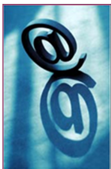
EPR on the web