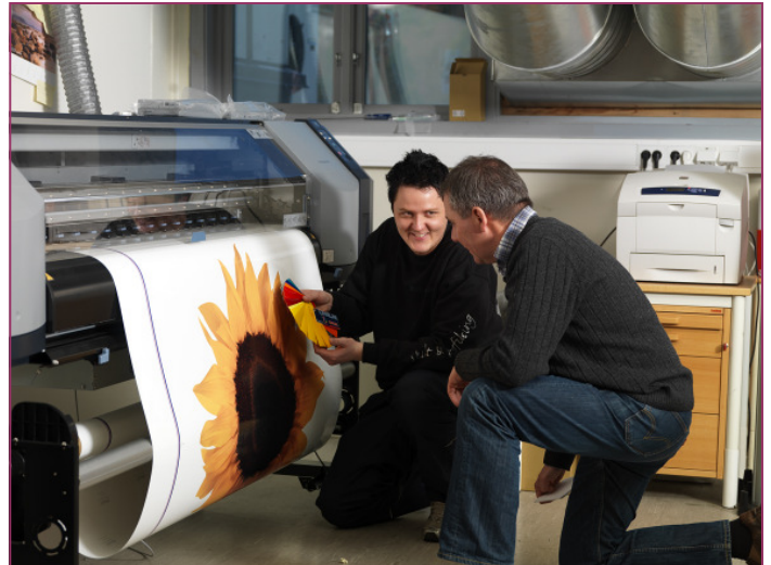
Decoration of a garbage car in Durapart community