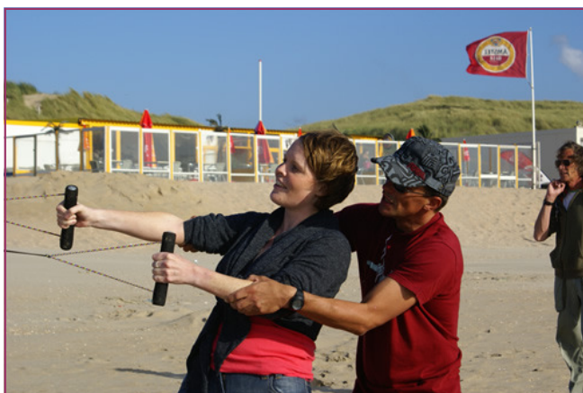
Social activity in Wijk Aan Zee

Few other seminars will take place in the second half of the year, while EPR and its members will proceed to the evaluation of the current CAP and the design of the planning for 2009-2010.