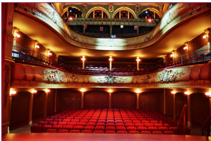
The classy Théâtre du Vaudeville will host the Public Affairs Event in 2008

EPR's Public Affairs event on Modernisation of disability-related Health and Social Services. A Way Ahead. will take place on 11 December 2008 in Brussels.