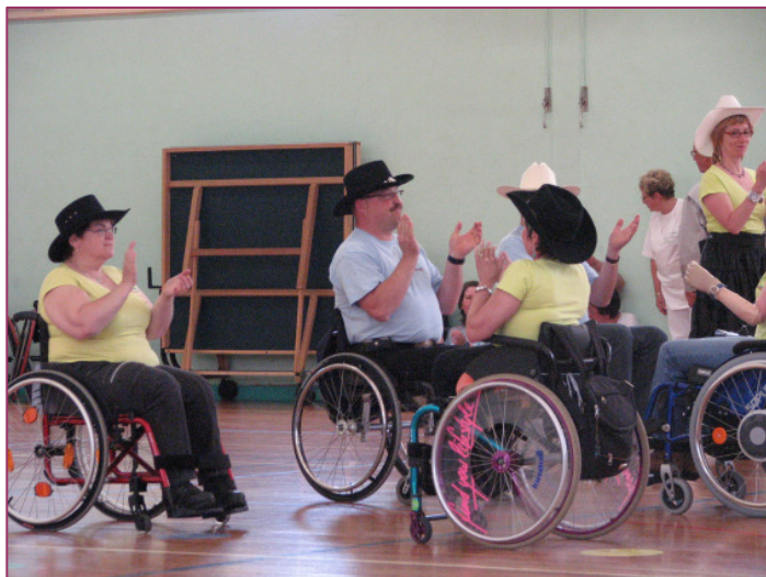
Sports for all