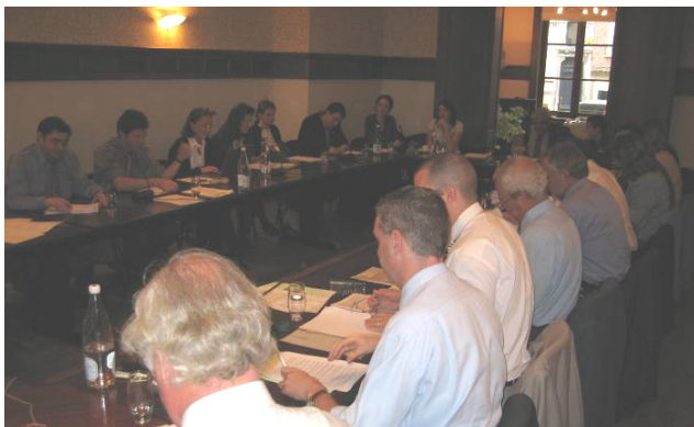
A large gathering of NGO social service providers around the table

On 25 September 2006 EPR, Workability Europe, EASPD, ET Welfare, Solidar, Caritas, FEANTSA and a few other networks of social service providers organised a very interesting joint Seminar on " NGO Social service providers as actors for social cohesion and inclusion ". The Seminar