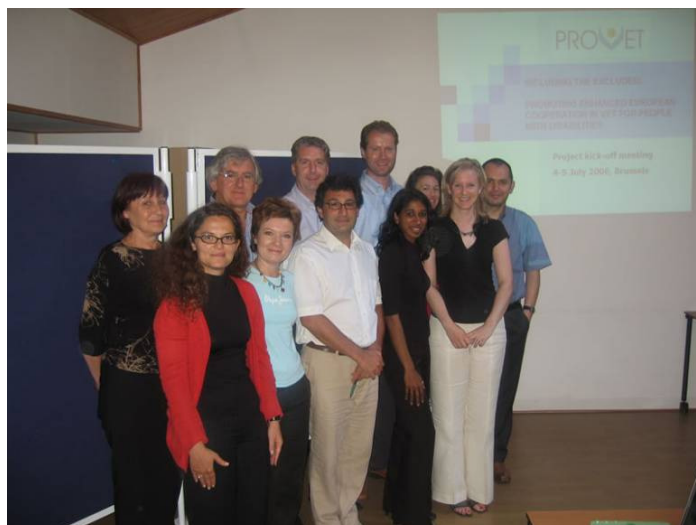
The project partners at the PROVET kick-off meeting

The project PROVET officially started in June 2006 and a kick-off meeting was organised on 4-5 July with all the partners. The main objective of the kick-off meeting was for the partners to agree on a concrete action plan. The partners met per strand of activities and prepared the methodology for the testing of the products. Upon return to their home centre, each of the six partners has created a small internal working group that has the task of matching and testing the respective product to the users' needs in its VET programmes and services. The testing will take place over a period of seven months in six different locations.