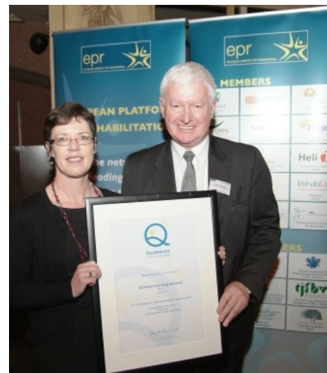
Certifications were handed out at the EQUASS Awarding Ceremony during the EPR Public Affairs Event on 11 December 2008 in Brussels.